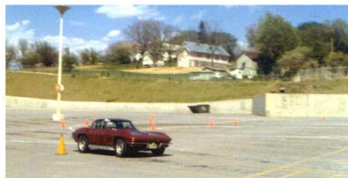
May 1970 - Ed Bitcom - South Roads