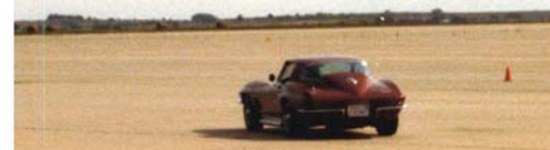
June 1970 Ed Bitcom - Airport Lincoln