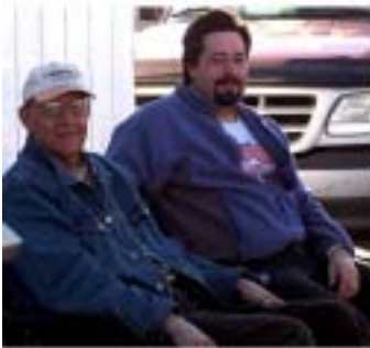
George & West