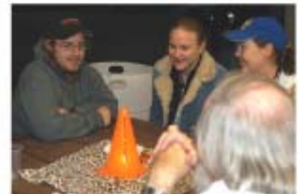
After a tough day!