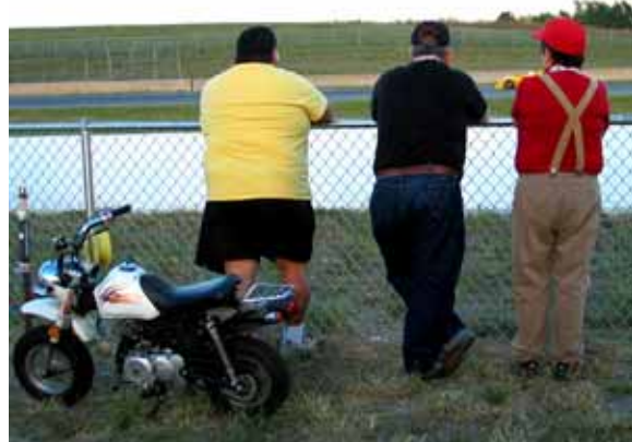
"Rest after a long work day"