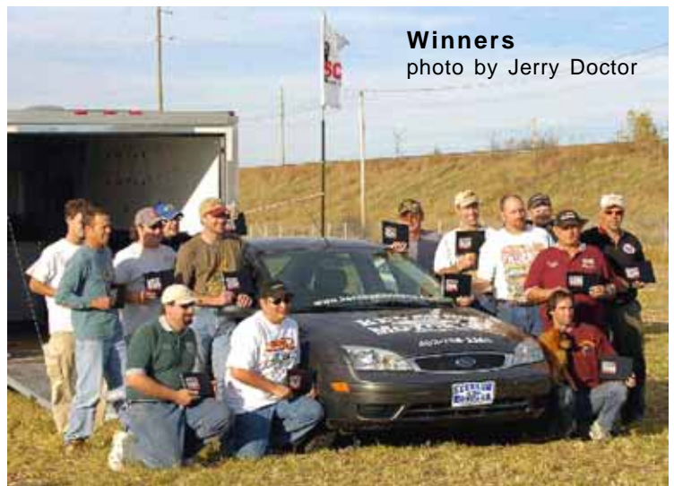
Winners