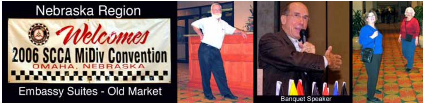
All Candid's