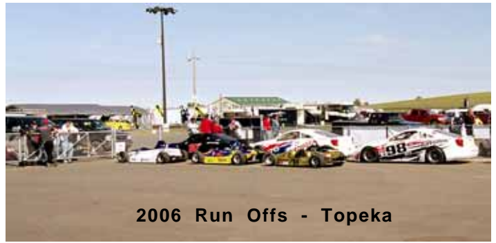
2006 Run Offs - Topeka

the monumental task at hand. Dwell on the noise and the chance to win will fade fast and be forever lost.