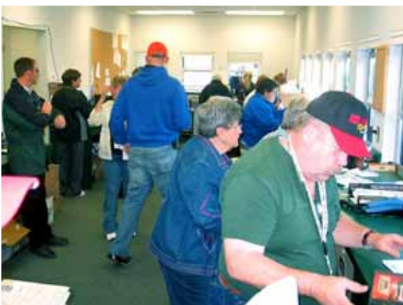
Inside Registra- tion & Express Tech